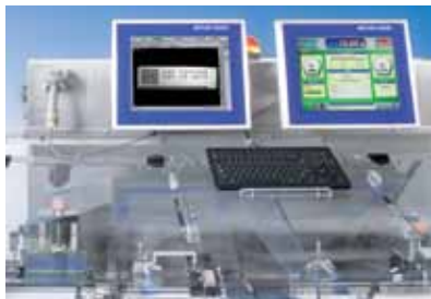
User-friendly interface for rapid product changeover

Track & Trace flexibility Optimum printing of unique series of digits or datamatrix barcodes to meet current and future legal requirements.