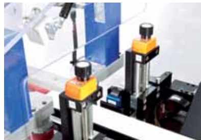
All components are fully adjustable for maximum flexibility