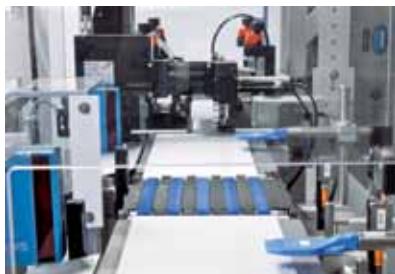
Increased quality control using multiple rejection stations