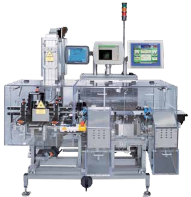
XS2 MV with laser marking system